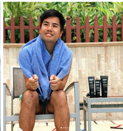
1 week Timeframe