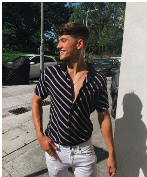
Best Post of Campaign